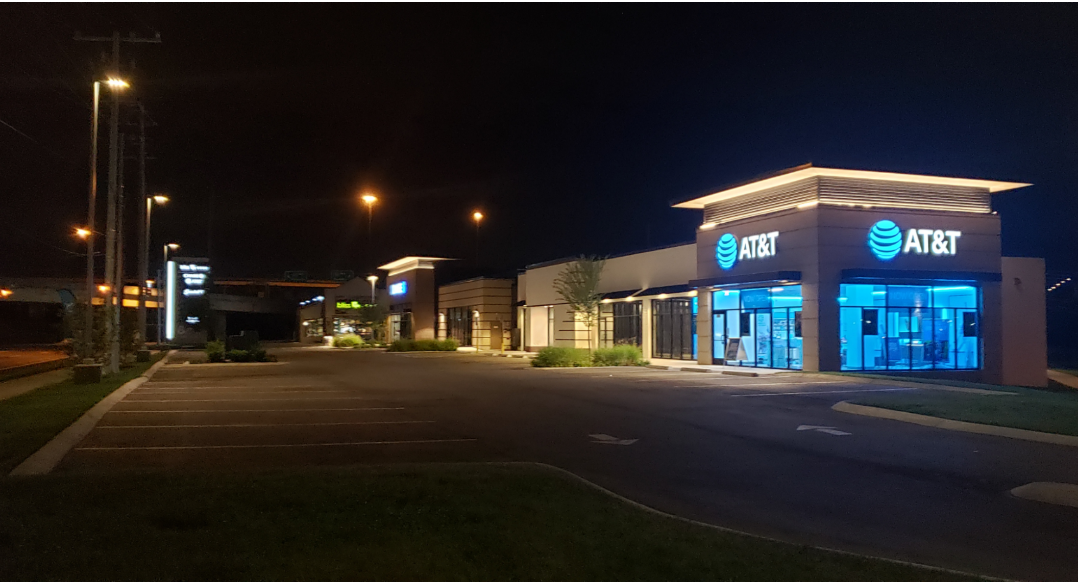
View from 8 th Avenue