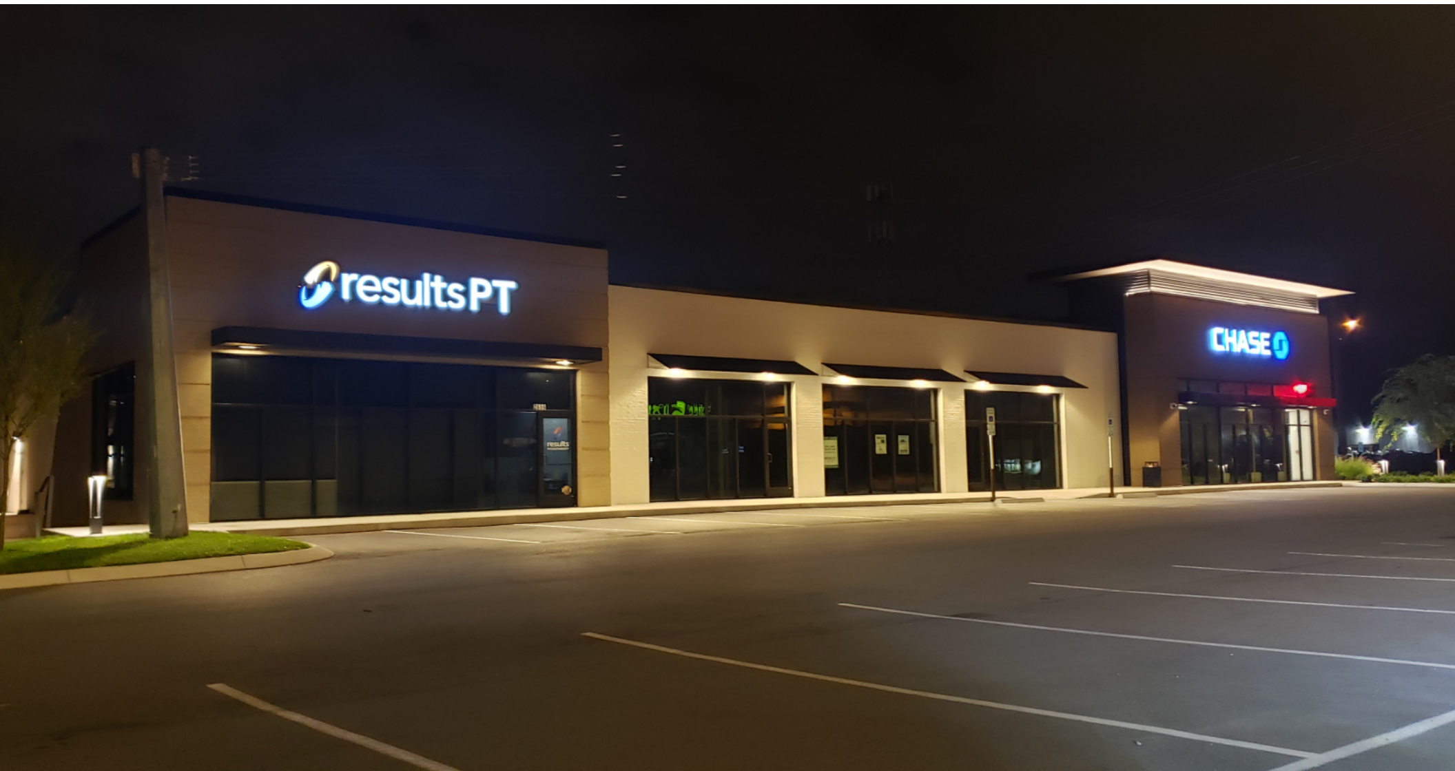
View from Gale Lane