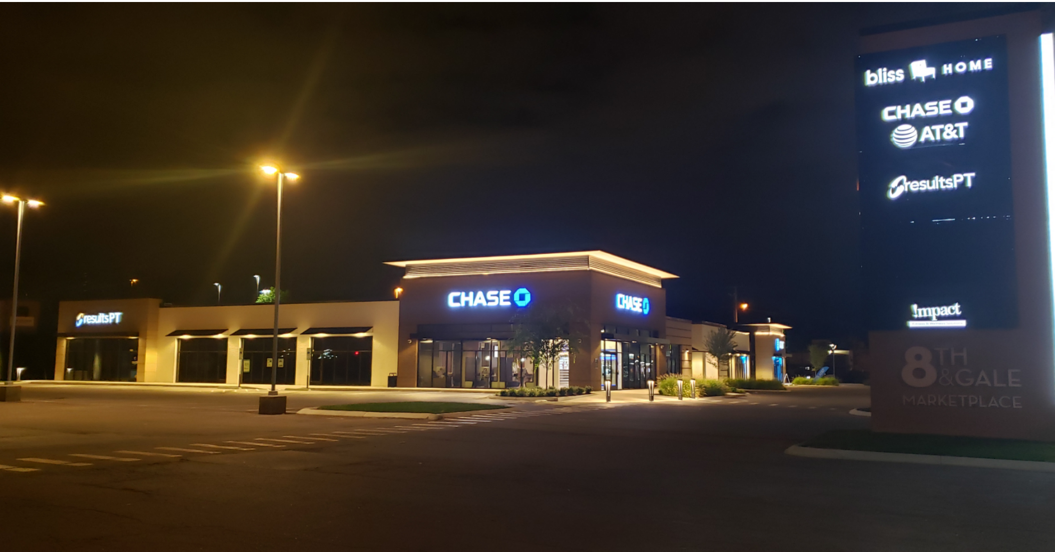
View from Main Entrance