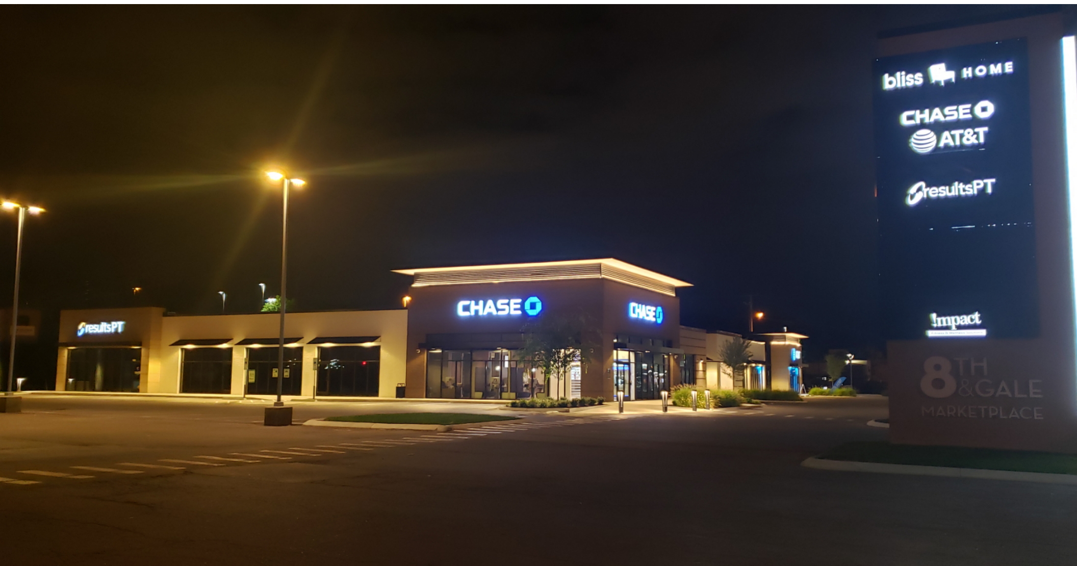
View from Main Entrance